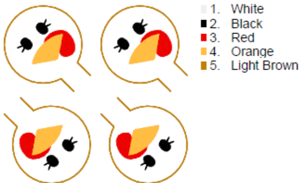
Turkeygirlpencil Sorted.pes 98.30x96.00 mm; 5,247 stitches 5 thread changes; 5 colors