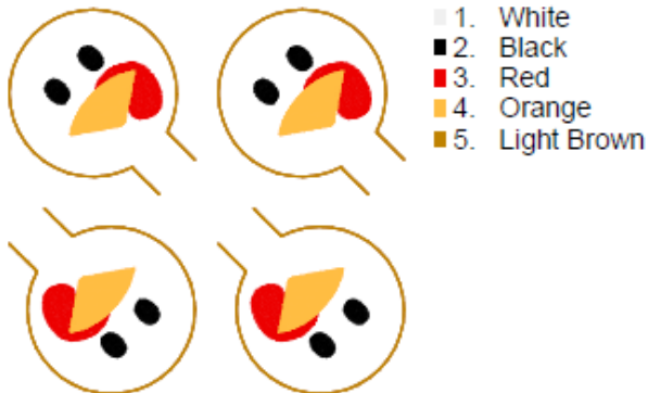
Turkeyboypencil Sorted.pes 98.30x96.00 mm; 5,067 stitches 5 thread changes; 5 colors

by GG Designs Embroidery Stitch count and colour chart